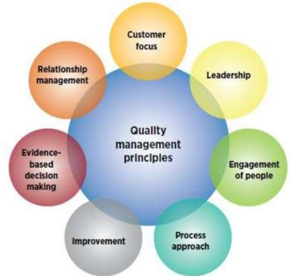
The Seven Principles of ISO 9001:2015

A Quality Management System provides customers the reassurance that the organization values and practices quality management principles.